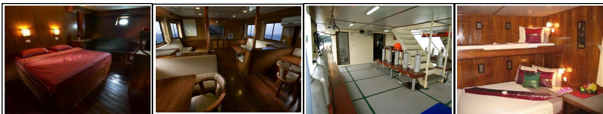
Pictures from L to R: Master Cabin; Luxury Lounge; Dive Deck; Deluxe Cabin.